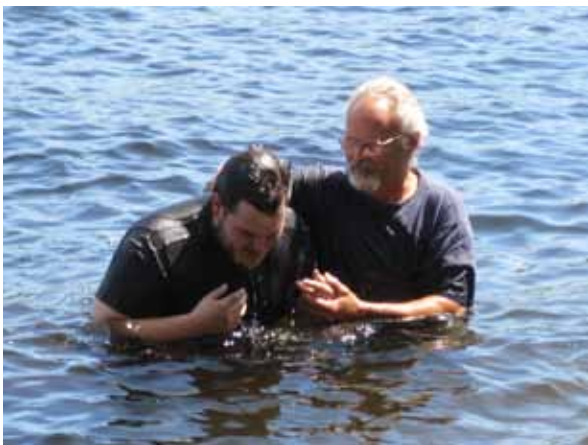
Post-baptism and very happy to be a part of the church.