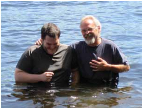
Sharing some pre-baptism levity on the temperature of the lake.