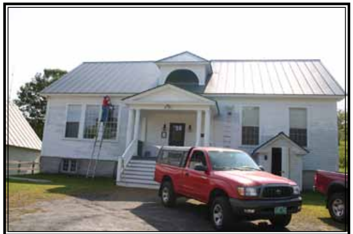
Taftsville Chapel undergoing late summer upgrade. New paint for the front of building.

It is not too late to make a donation but we need to know about it ASAP. Contact Allen Guntz with donation information.