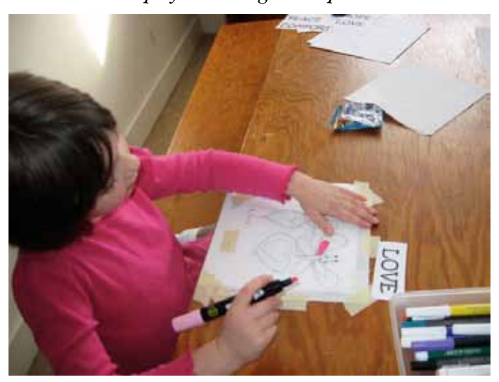
(Evelyn transfers her butterflies and hearts illustrating LOVE onto a cloth block. The children used their own ideas and creativity to illustrate abstract ideas.)

(Mabel makes a JOY block while Calvin draws a cozy fire to illustrate COMFORT. He was inspired by the Log Cabin quilt design with the red or yellow center blocks representing the chimney and hearth.)