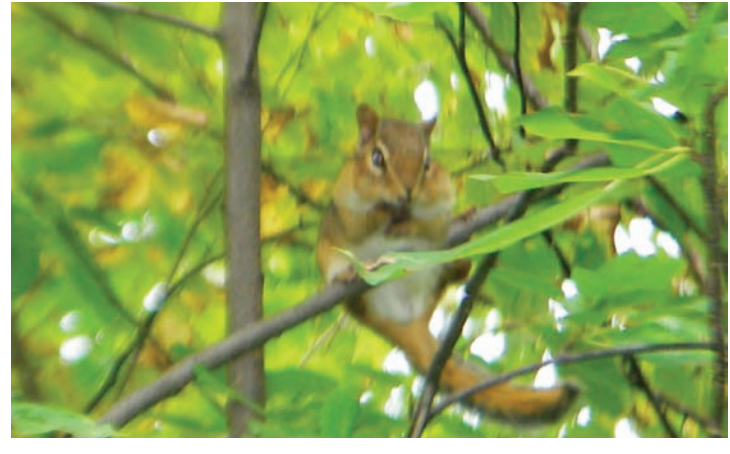
during the church trip to Groton State Park.

And now it's September 15. The hall basement has been cleaned and dried out, and carpentry repairs and painting of ceiling, walls, and floor are the next tasks for volunteers. Hillary Clinton coined the title "It Takes a Village", which is also an apt title for East Barnard, a strong little community that keeps on working together to make things happen. With sweat and determination coupled with hope (or vice versa), our hall will be restored and ready for that dinner one month from today!