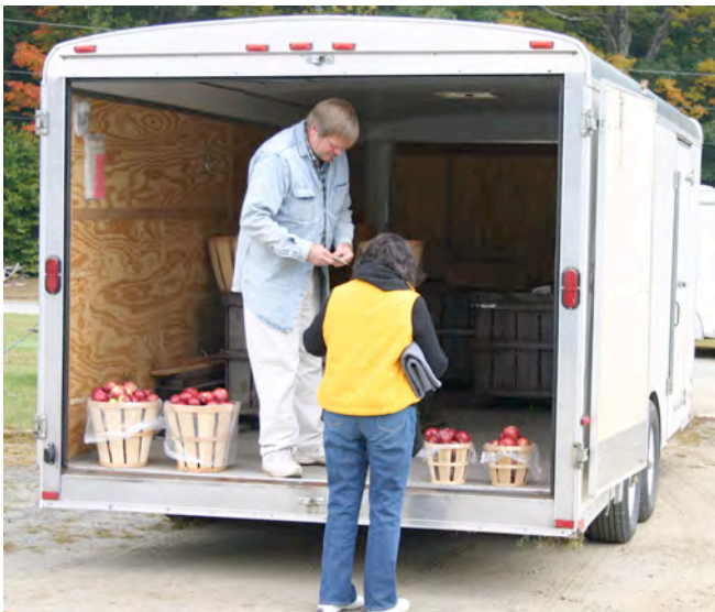
Apple for sale at BBC Auction