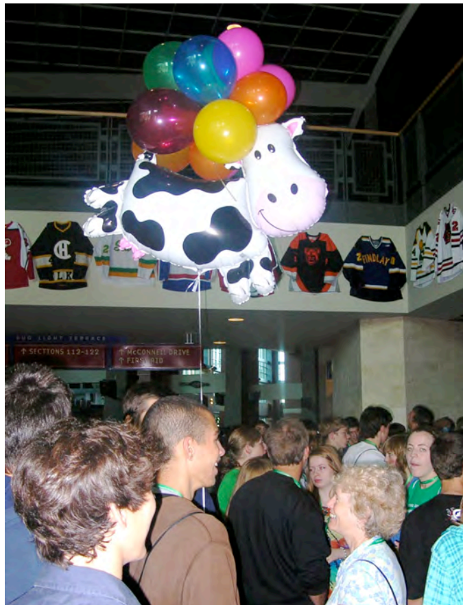
The cow was our mascot at the convention