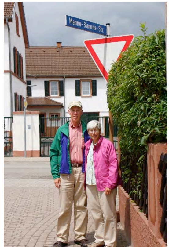
↑ On Menno Simons Street in Ibersheim, Germany