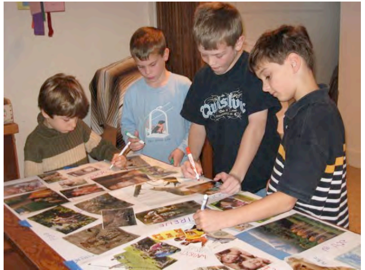
Sunday school boys write PEACE in several languages among pictures they chose for a mural depicting the vision of peace in Isaiah 11.