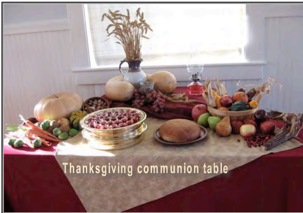
Thanksgiving communion table

*Our special Thanksgiving offering was designated for SEVCA, an organization that helps households in the Upper Valley with their fuel expenses. The total received was $1,506.