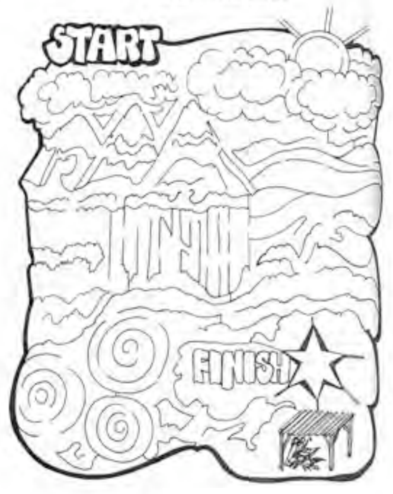
Maze submitted by Carie Good