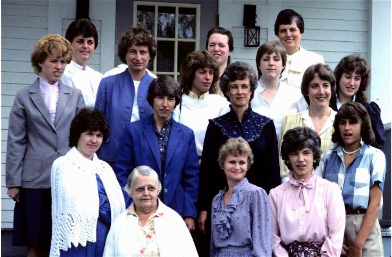
Taftsville Chapel Women—May 1984