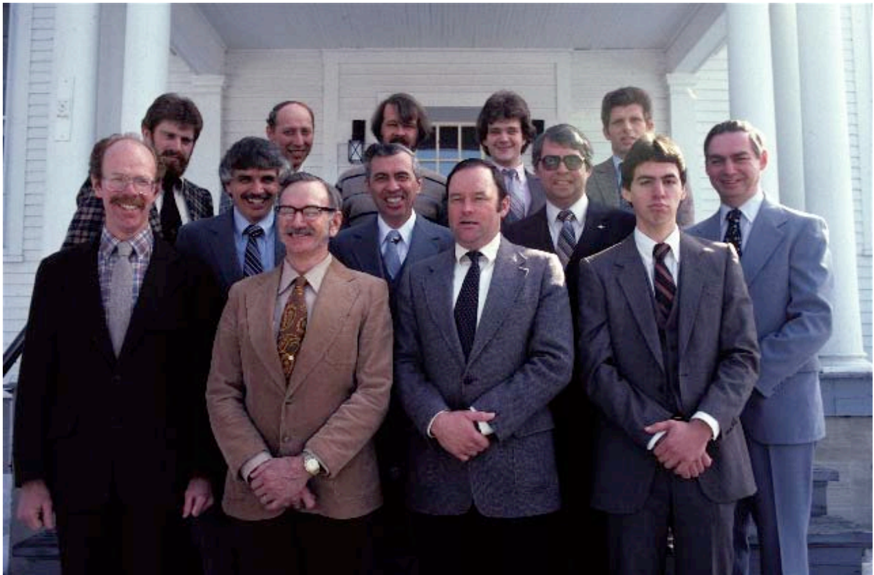
Taftsville Chapel Men's "Suit Sunday"—1984