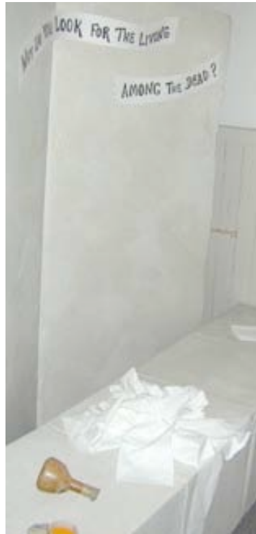
Inside the tomb