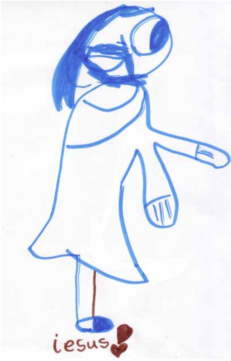
Evelyn McCrory's Drawing of Jesus