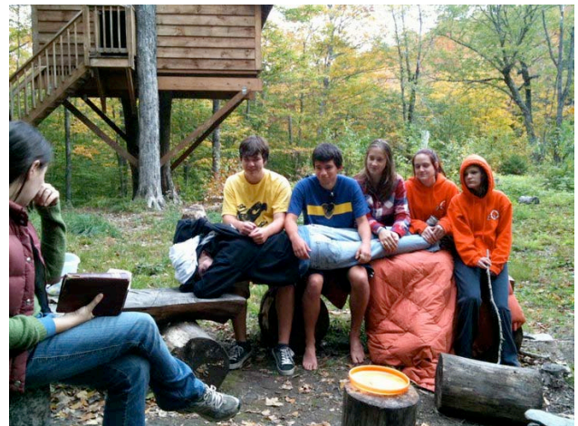
After the Bethany Birches Auction the youth braved the cold and spent the afternoon and night at the treehouses at BBC.

The convention's theme is "Bridges to the Cross" based on 2 Corinthians 5:16-20. For more information on the convention go to: http://www.mennoniteusa.org