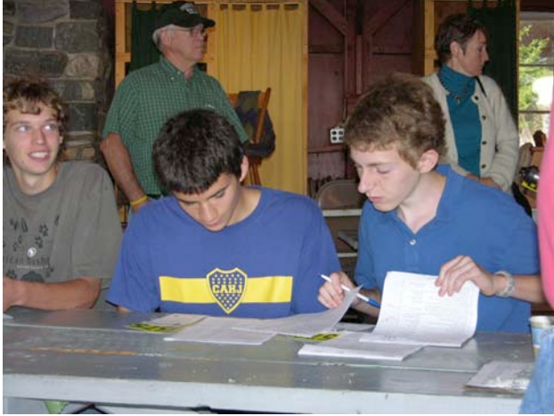
Youth helping during the BBC auction for online bidders.

If you've been following the Youth on Facebook.com, you already know what they've been up to. If not, here's what you've been missing!