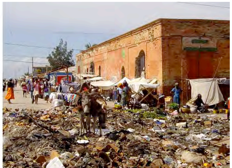
The Streets and Market Places of Haiti

The government is dysfunctional, more concerned about obtaining /maintaining power, status and wealth than in caring for the citizenry. More energy goes into power squabbles than actually goes into running the country. You want to promote reform... You want to help establish law and order, but in a country where the police got their jobs so that they could take advantage of the population and make a few extra bucks, it is a difficult endeavor.