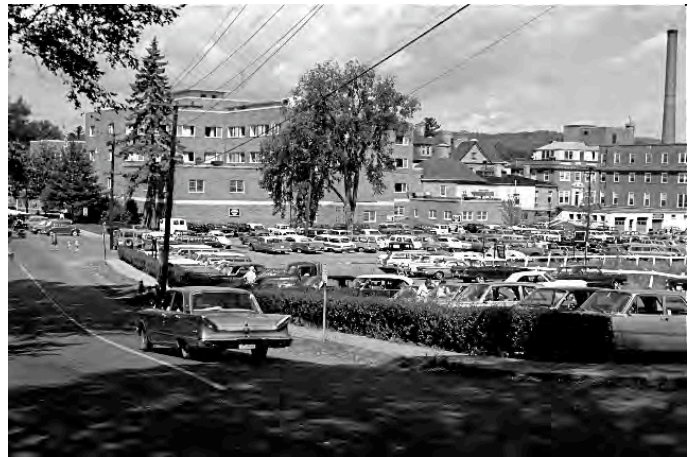
Mary Hitchcock Memorial Hospital facilities during the time this 1-W group worked there