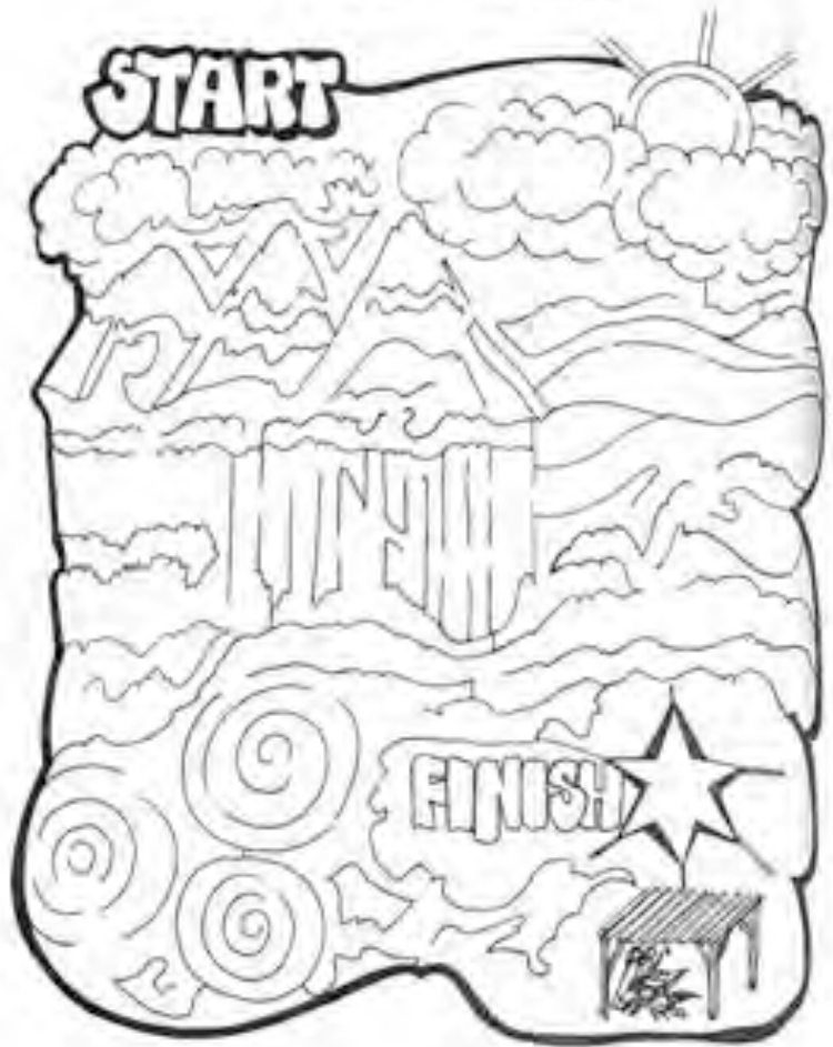
Maze submitted by Carie Good