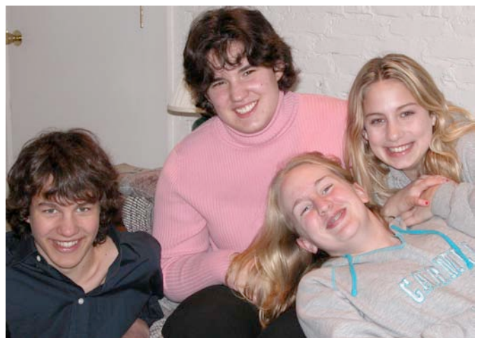
The Youth Having a Grand Time